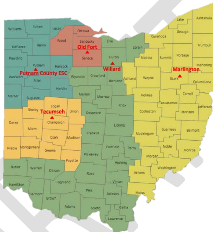
Figure 1. Location of Migrant Education Program LEAs

The primary services delivered to students by the LEAs include: